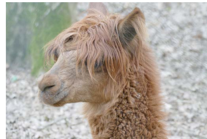
A perfect picture?

Of the three, Pixabay is the one I usually go to first as it has a huge database of high-quality images which are seemingly more oriented towards business than the other sites. It doesn’t always provide the perfect picture straight away and you do have to navigate past some unexpected and bemusing images at times (just for fun, I searched for a “perfect picture” on Pixabay – the result is displayed below!), but it’s a resource I can’t imagine being without now.