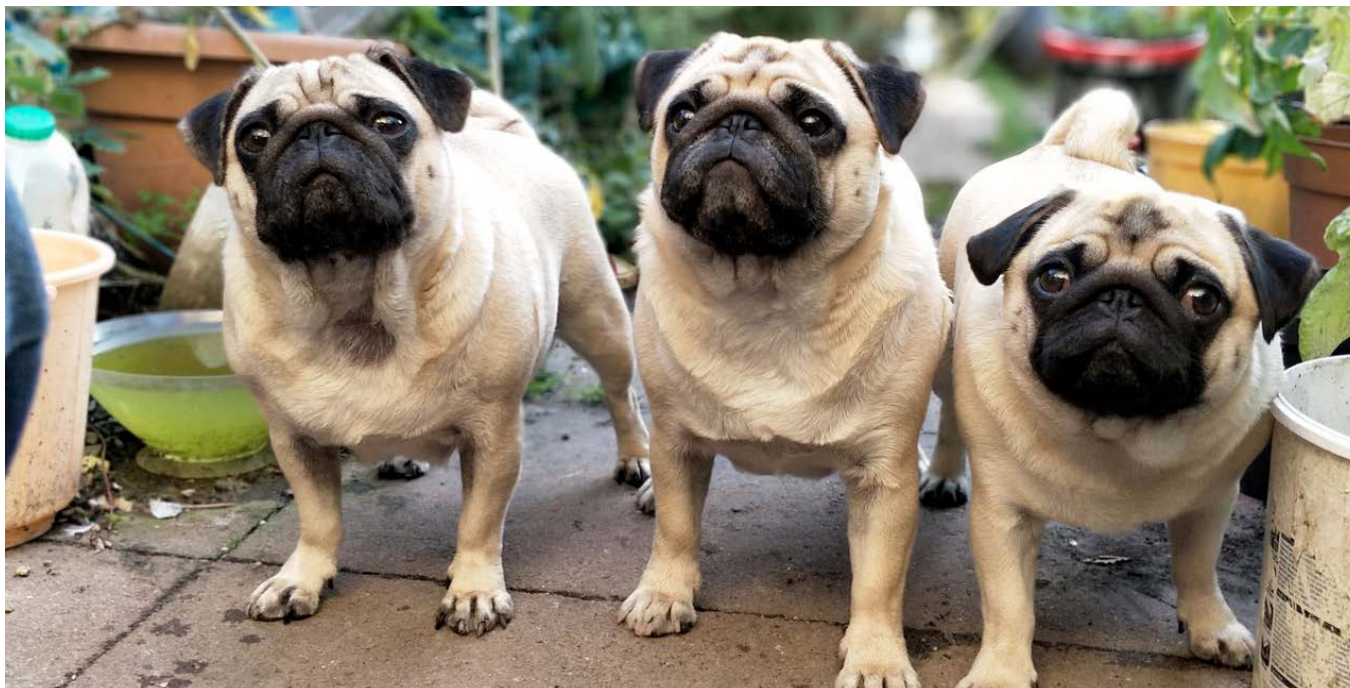
A grumble of pugs

P.S. my personal favourite collective nouns are "a smack of jellyfish", "a grumble of pugs" and "a beautification of spatulas".