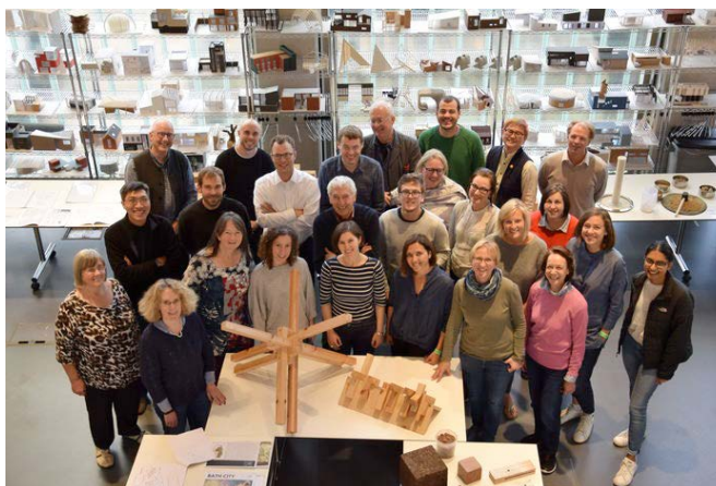
Information Design Summer School – Class of 2018

The 2019 Summer School has just been announced. The week-long intensive focus on information design, with lectures, group work, critiquing and discussion will be held from 2 to 6 September at the University of Bath. More details can be accessed here .