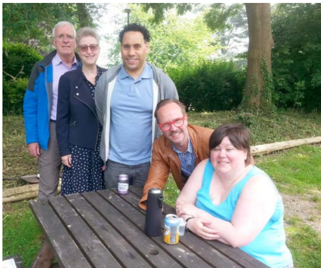
Members of the Thames Valley group during a visit to Bletchley Park last summer

For a real sense of community, seeing, feeling, even smelling other technical communicators face-to-face can never be replicated by forums or video apps. We encourage you to join your local meetings,