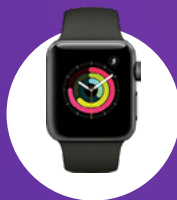
Apple Watch Series 3 42mm