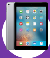
Apple iPad 9.7-inch, 32GB