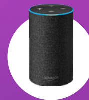
Echo (2nd Generation)