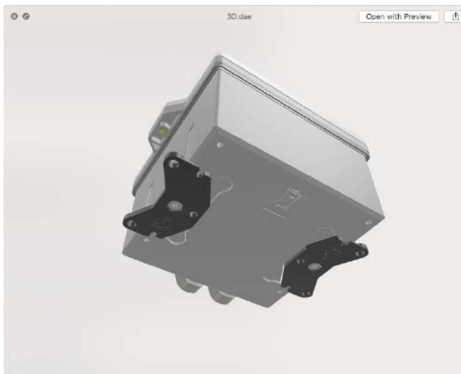
Preview of an exported 3D .dae file

At one time I was receiving these files on a regular basis and I spent a lot of time trying to export and reuse them. Many online sources tell you to use this or that software but, personally, the only reliable solution I found was to use a piece of software called SimLab composer . You can download the trial and use it for 21 days and there are many versions for sale. The Pro version is reasonably priced and does the trick, extracting the 3D file in various formats which are then fully editable.