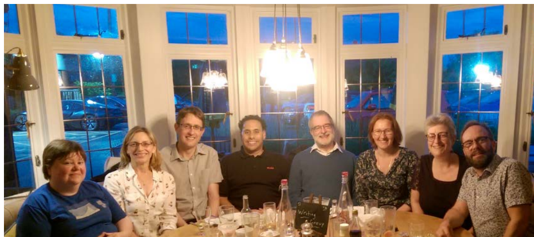
The Thames Valley group during their latest “life-changing” meeting