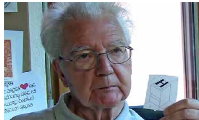
Adrian Frutiger: 'Type is the clothing a word wears, so it must be subordinate to the content.'

Adrian was a Swiss typeface designer who created many influential sans serif faces including Univers, Frutiger and Avenir. He influenced the direction of digital typography in the second half of the 20th century and into the 21st. His career spanned the hot metal, phototypesetting and digital typesetting eras. Until his death, he lived in Bremgarten bei Bern. You can read the obituary here: www.theguardian.com/artanddesign/2015/oct/05/adrian-frutiger .