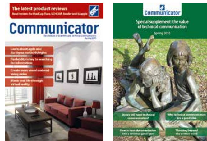
Cover of Spring edition of Communicator and its supplement.

This year we entered Communicator , Spring 2015 and the accompanying special supplement on the value of technical communication into the IoIC Awards – and we won an Award of Excellence award!