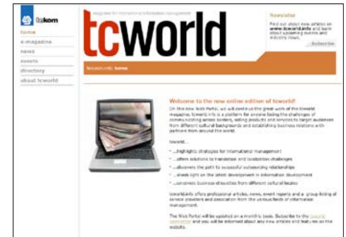
New tcworld website

tcworld.info offers professional articles, news, event reports and a group listing of service providers and associations from the various fields of information management. The web portal will be updated on a monthly basis. The tcworld newsletter will keep you informed about any new articles and features on the website. planning, research and measurement.